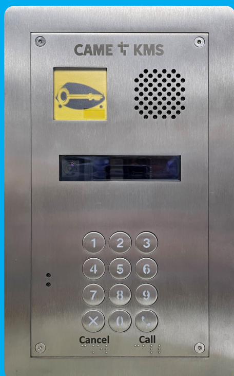
Reader shown in situ

The CAME KMS SimpleKey HF reader provides all the benefits of CAME KMS residential access control, together with additional security via our bespoke HF technology.