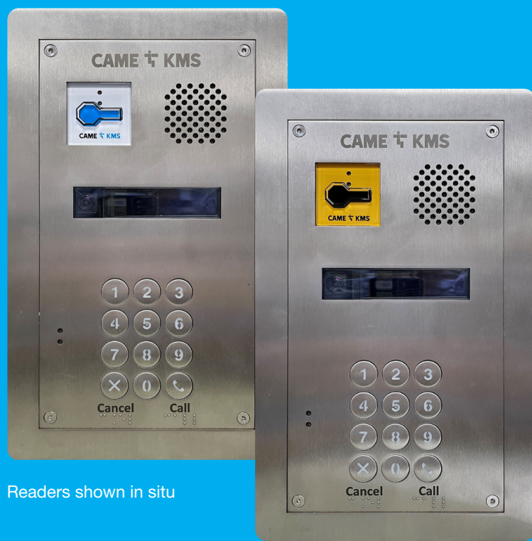
Readers shown in situ

The CAME KMS SimpleKey readers provide all the benefits of CAME KMS residential access control, for use with fobs and other ID devices.