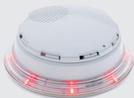
SOUNDER - 8 LED Sounder/Beacon Enhances Accessibility.